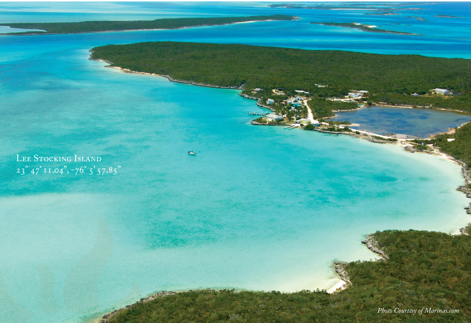
LEE STOCKING ISLAND 23° 47' 11.04", -76° 5' 57.85"