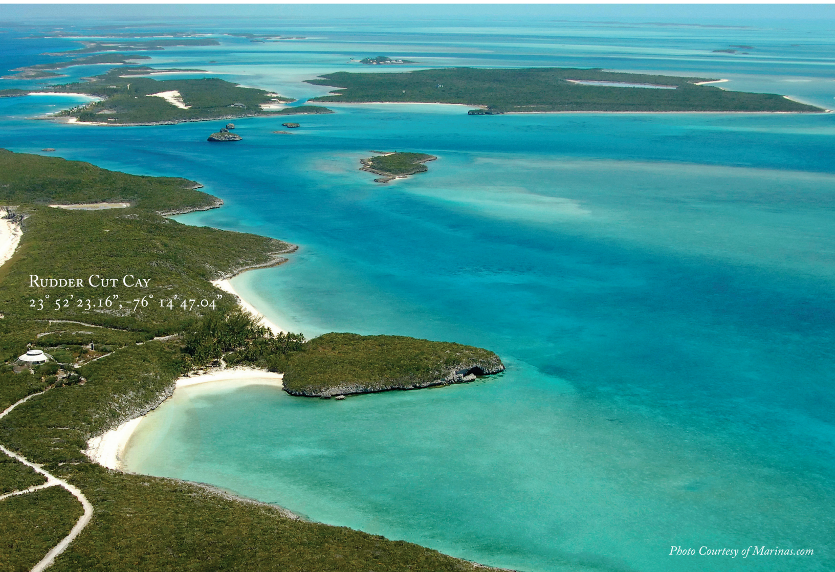
RUDDER CUT CAY