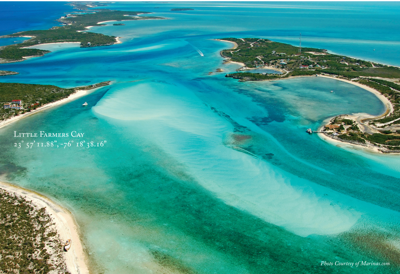
LITTLE FARMERS CAY 23° 57' 11.88", -76° 18' 38.16"